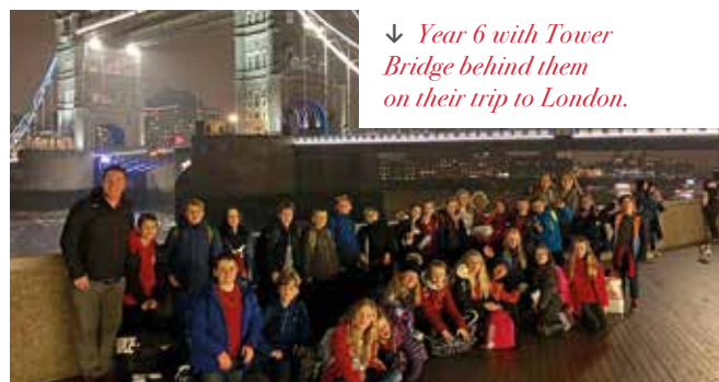
↓ Year 6 with Tower Bridge behind them on their trip to London.

Year 6 pupils have the opportunity to go on an overnight trip to London and attend a residential outdoors pursuit centre at Storey Arms in Brecon. During the week they experience a range of activities including walking, rock climbing, canoeing, swimming, cooking, cleaning and team building.