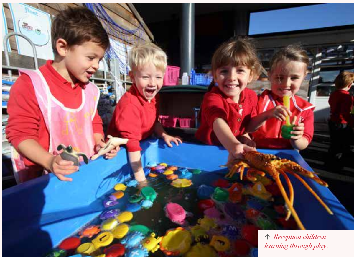
↑ Reception children learning through play.

As a Church school we believe that the act of giving or sharing with less fortunate people is important. Our Lent Charity is our main charity event, which supports a different local, children's charity each year.