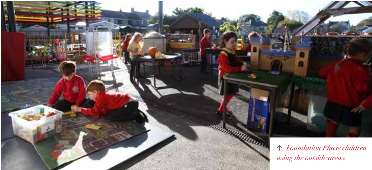
↑ Foundation Phase children using the outside areas.