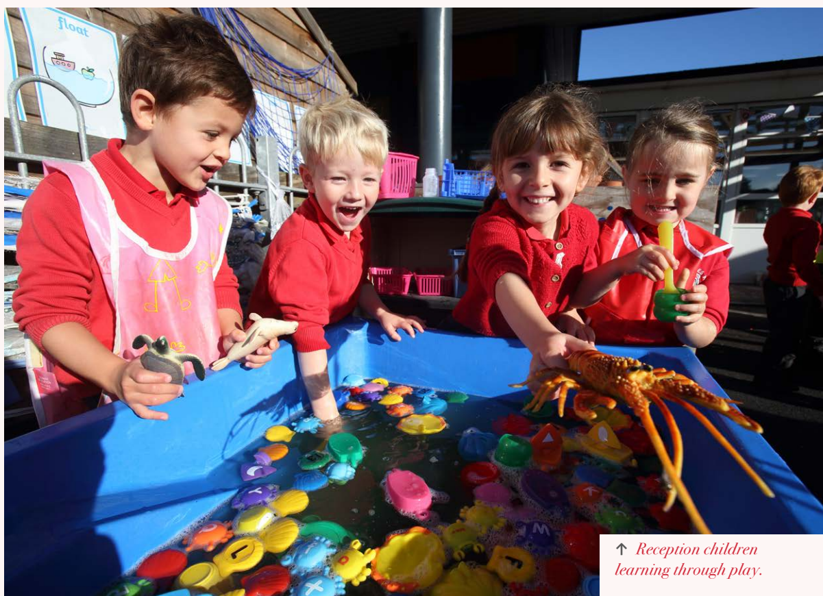
↑ Reception children learning through play.

As a Church school we believe that the act of giving or sharing with less fortunate people is important. Our Lent Charity is our main charity event, which supports a different local, children's charity each year.