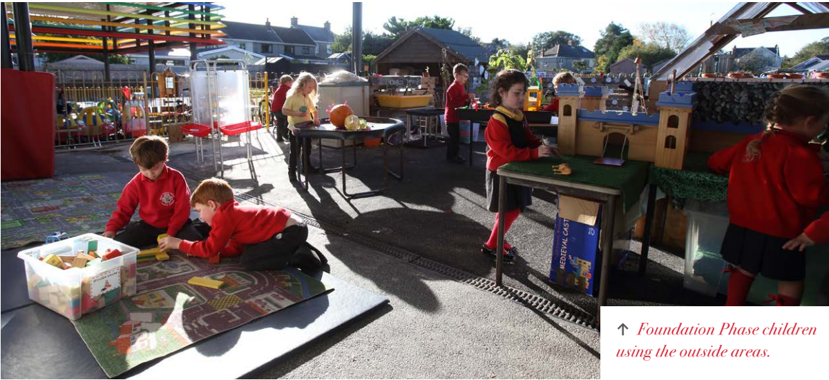
↑ Foundation Phase children using the outside areas.