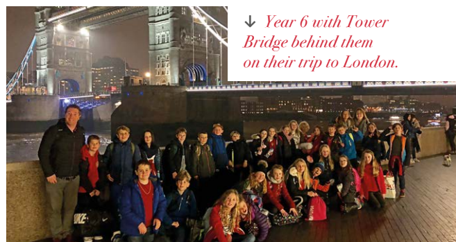
↓ Year 6 with Tower Bridge behind them on their trip to London.

Year 6 pupils have the opportunity to go on an overnight trip to London and attend a residential outdoors pursuit centre at Storey Arms in Brecon. During the week they experience a range of activities including walking, rock climbing, canoeing, swimming, cooking, cleaning and team building.